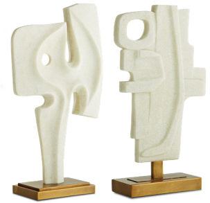
"MAEVE" (LEFT) AND "MARTIN" SCULPTURES ($480-$600/ARTERIORES)

Abstract pieces in cubist curves and peculiar shapes remind us of DALÍ and PICASSO.