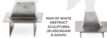
PAIR OF WHITE ABSTRACT SCULPTURES ($1,450/AGAIN & AGAIN)