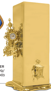
"DALÍ" WATCHWINDER (FROM $20,670/BOCA DO LOBO)

Hello, Dalí! Surrealist Salvador Dalí was fascinated by presenting everyday objects in bizarre fashion. These accessories echo his style, making for the ultimate conversation starters.