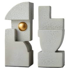
L'OBJET "CUBISME" BOOKENDS ($235 EACH/LAURA LEE CLARK)