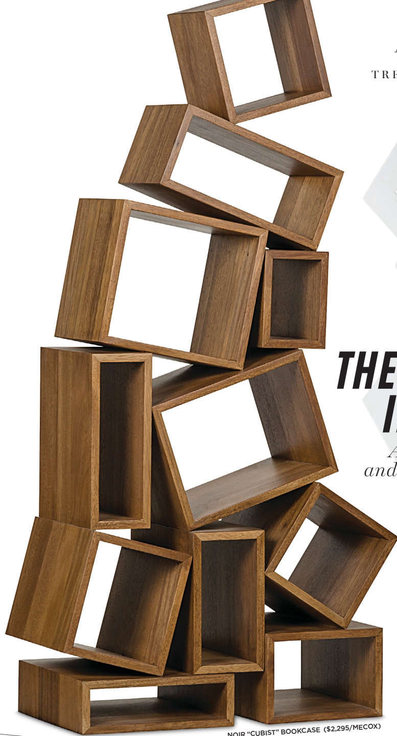
NOIR "CUBIST" BOOKCASE ($2,295/MECOX)