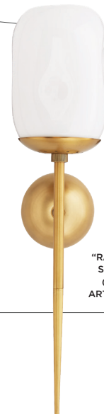
"RAMIREZ" SCONCE ($420/ARTERIORES)

PAIR OF WHITE SCULPTURES: "CUBISME" BOOKENDS, "YELLOW DREAMER," AND "LITO" PAPERWEIGHTS: CHRIS PLAVDAL; ALL OTHERS: COURTESY